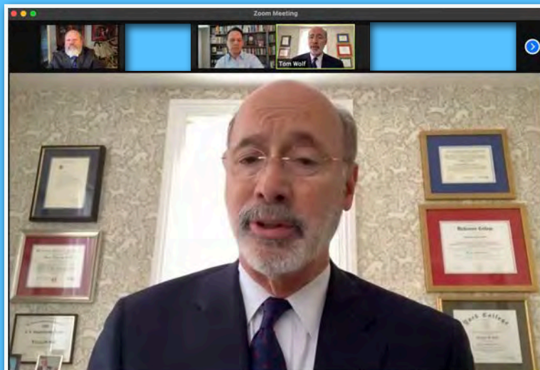
Pennsylvania Governor Wolf meets victims of child sexual abuse by clergy, apologizes for referendum snafu.