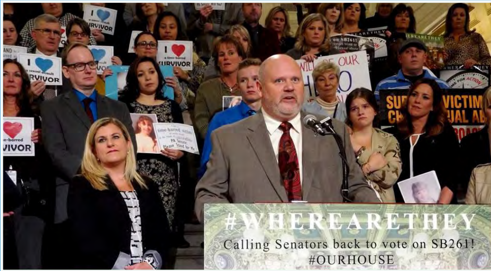
In Harrisburg PA with courageous survivors calling for Pennsylvania's State Senators to come back into session to vote on SB261.

#9. Advocacy for lookback windows by means of statutes of limitation legislation.